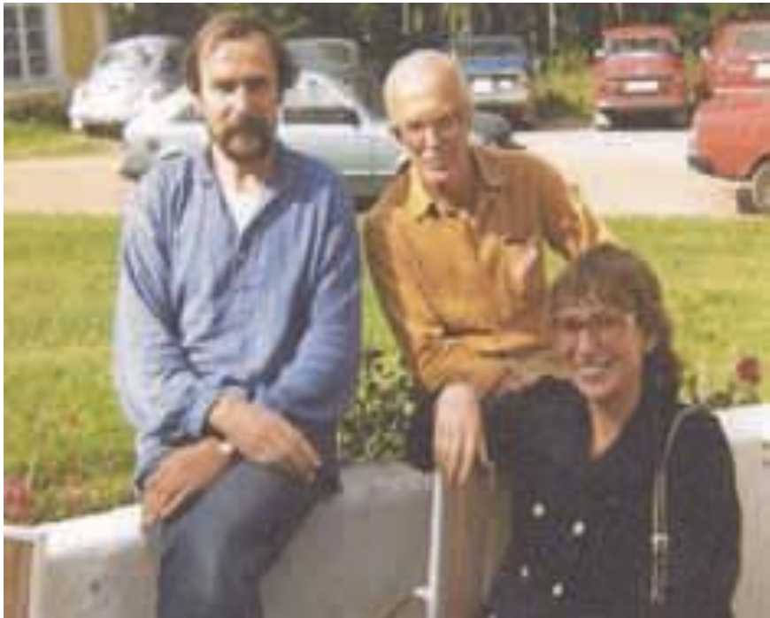
NoFS`81 Västra Langö, Sweden